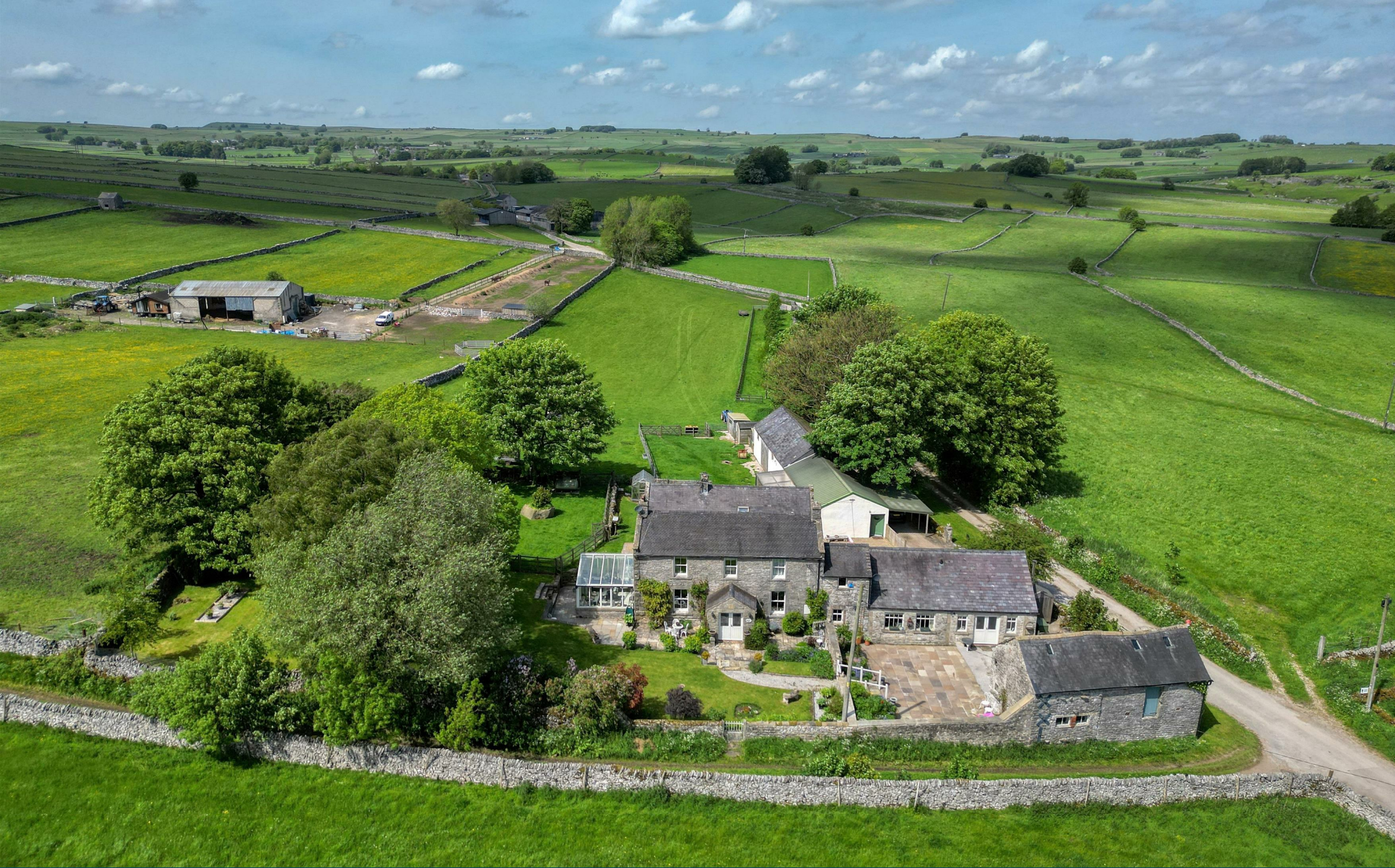
Cross Lane Farm, Cross Lane, Monyash, Derbyshire, DE45 1JN